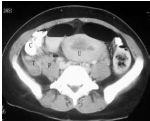
Figure 2. Contrast computed tomographic scan at the level of pelvic brim showing a tubular structure (T), which simulated appendix with lucent centre and enhancing wall, corresponding to the thrombosed right ovarian vein at laparotomy. Caecum (C), right psoas muscle (P), uterus (U)

The puerperium was complicated by fever (38.2°C) on day 2. She complained of left loin and back pain with right loin tenderness elicited. Intravenous antibiotics were given. Bedside ultrasound for kidneys and pelvis did not show any abnormality. White blood cell count was 11.9 \times 10^9 /L and mid-stream urine showed no growth. In view of the persistent swinging fever, ultrasound was repeated on day 12 showed a tubular collection extending from below the lower pole of right kidney to right iliac fossa with the suspicion of an appendicular abscess (Figure 1). Computed